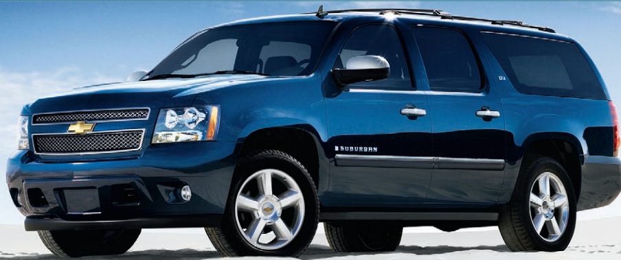
Suburban half-ton LTZ 4x4 in Dark Blue Metallic with available features

For 73 years, Chevy Suburban has filled your big needs with powerful Vortec engines like the standard 5.3L V8 engine in half-ton models that incorporates Active Fuel Management technology and helps Suburban 2WD offer an EPA estimated MPG 20 highway. We know families travel in Suburban every day, so the list of standard safety features includes StabiliTrak and head-curtain side-impact air bags 1 for all rows. 2009 half-ton models earned the highest possible rating in government frontal and side-impact crash tests — five stars: 2